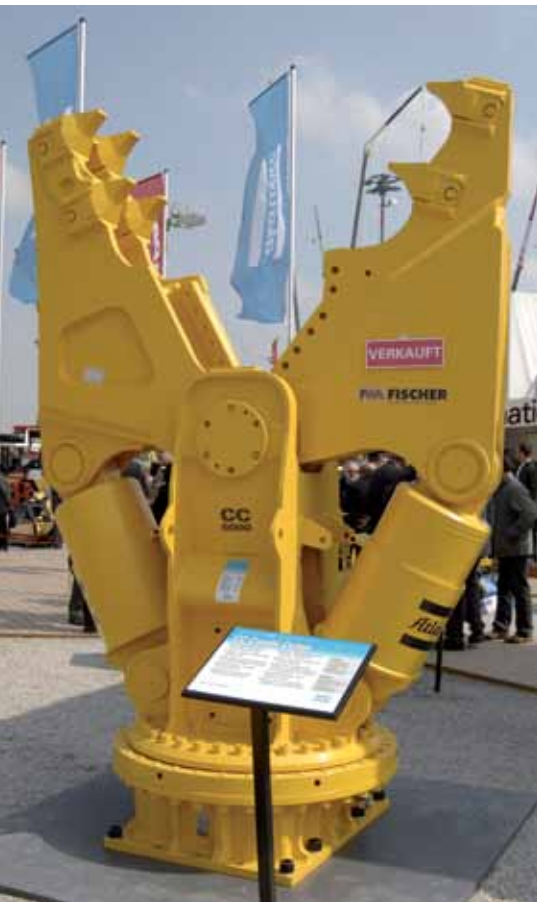
Atlas Copco's CC 6000 hydraulic CombiCutter weighs 6,5 tonnes and is designed for carriers in the 58 to 85 tonne class. The new cutter has a crushing force at the front of 180 tonnes and a cutting force of 650 tonnes.