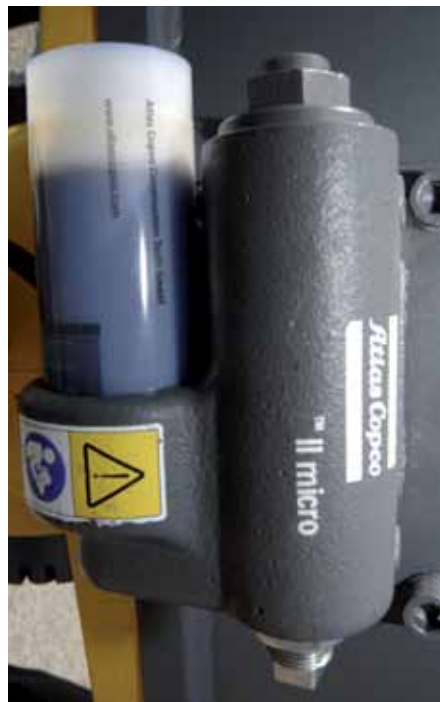
Atlas Copco's Contilube II Micro system is an automatic lubrication system for hydraulic breakers weighing less than 500 kg. Fitted to the adapter plate of the breaker, it offers optimum protection while minimising consumption of lubricating chisel paste.

the B version or box jaw," said Mr Hohn.