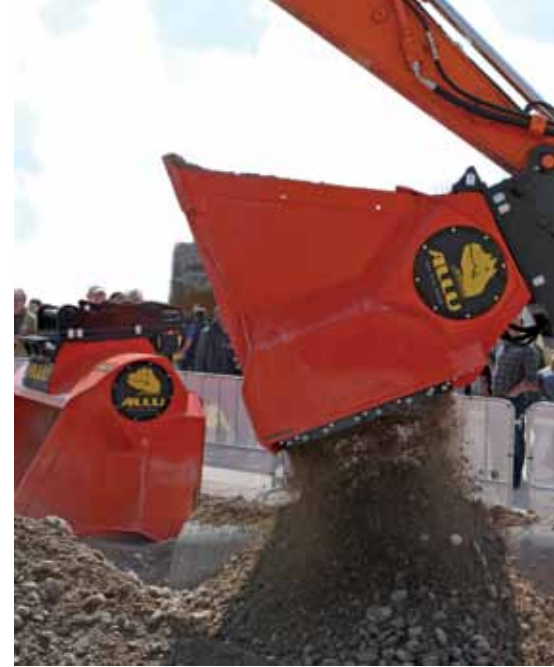
Featuring basic, strong and heavy duty frames, Allu's D-series has interchangeable blades enabling the bucket to both crush and screen, producing an end product of between 0 and 15 mm or 0 and 25 mm.

Mr Hohn believes there are two distinct types of contractor when it comes to attachment sales.